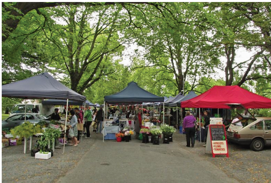
Fig. 3. The framers' market revives the historic garden space at the Riccarton House every Saturday morning [Tóth 2014]