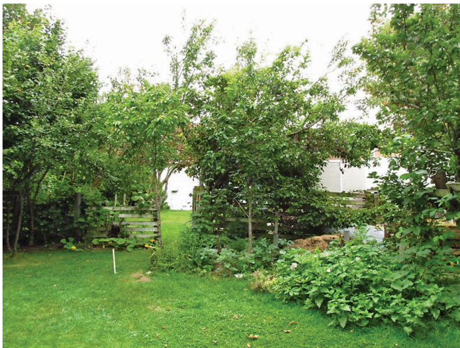
Fig. 5. The backyard of a family house with lawns in the central parts and fruit trees, vegetable plots and trees for fuel wood in the peripheral parts and along the land boundaries [Tóth 2014]