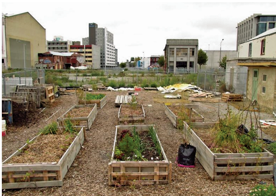
Fig. 4. Intra-urban public vegetable plots of the Agropolis Urban Farm reviving a post-earthquake empty space in the city centre of Christchurch. The farm provides a public space for social interaction and serves as an urban design and revival tool dealing with a post-earthquake intra-urban empty space situation [Tóth 2014]