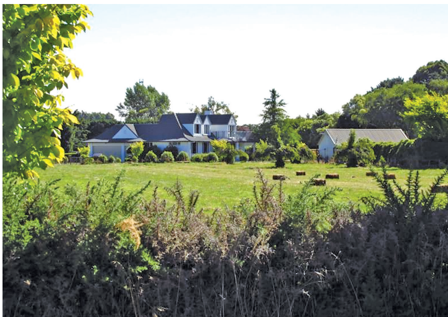
Fig. 7. A typical lifestyle block with a relatively large family seat surrounded by ornamental plants and an extensive lawn. The high-quality land is not used for growing own food or other farming activities at all

(from 1 to 10 ha) have changed the landscape character and dominate the peri-urban area of Christchurch. The following figure shows a typical example of a lifestyle block at the peri-urban fringe of the city, on a former farmland, where there is no agricultural production and the largest part of the land is covered by lawn.