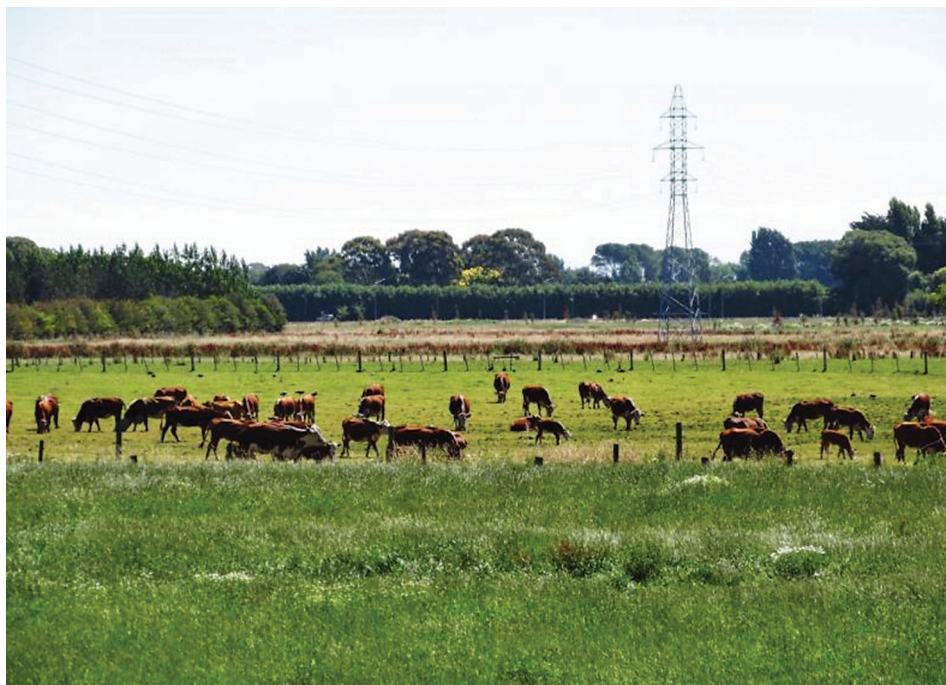
Fig. 6. Cattle breeding at the Christchurch city area. The farmland consists of large grazing areas subdivided and surrounded by shelterbelts [Tóth 2014]