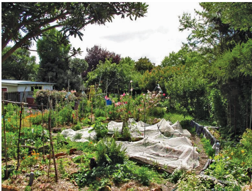
Fig. 2. View of the community garden inner structure. The garden space is enclosed by higher woody vegetation. In the rear part of the garden, there is a small orchard. The central part of the garden is intensively covered by small vegetable plots [Tóth 2014]